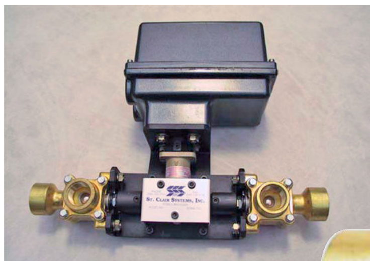
Size 3/4 inch Saint Clair Systems Six way Temperature Control Valve

Designed to modulate water for accurate temperature control of paint when both heating and cooling are required.